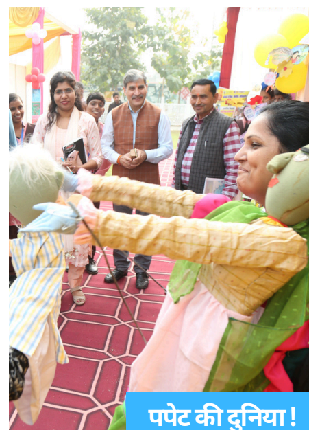
पपेट की दुनिया !