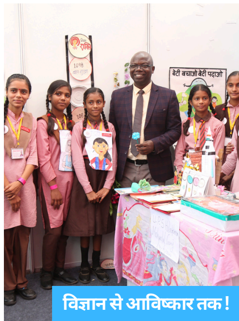
विज्ञान से आविष्कार तक !