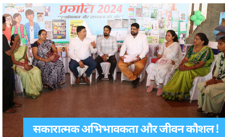
सकारात्मक अभिभावकता और जीवन कौशल !