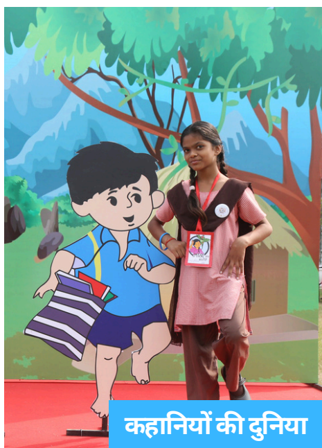
कहानियों की दुनिया