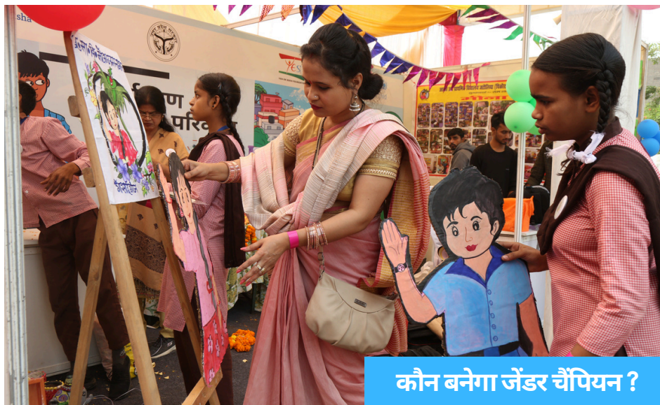
कौन बनेगा जेंडर चैंपियन ?