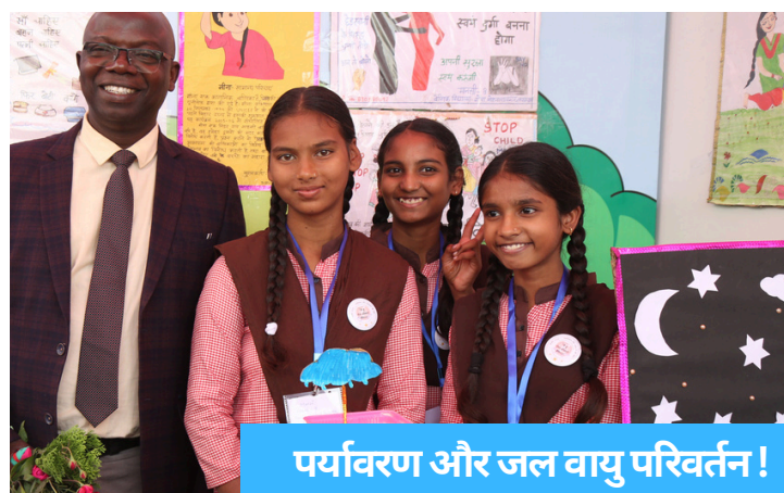
पर्यावरण और जल वायु परिवर्तन !