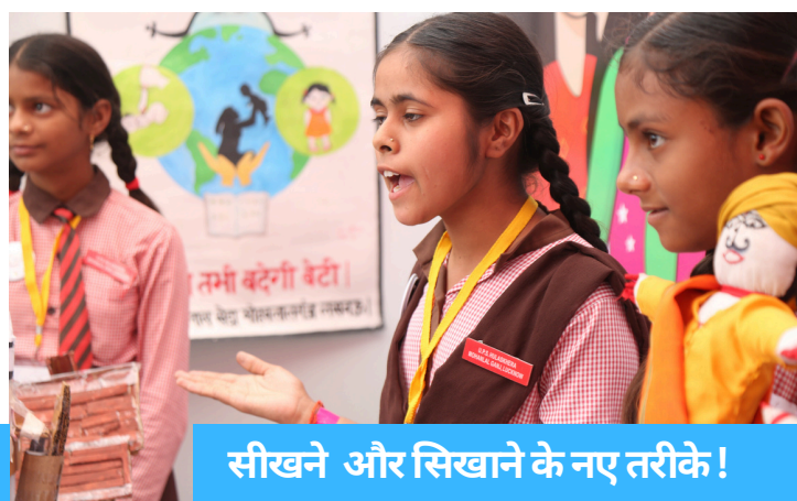
सीखने और सिखाने के नए तरीके !